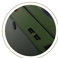
Quick Charging Technology